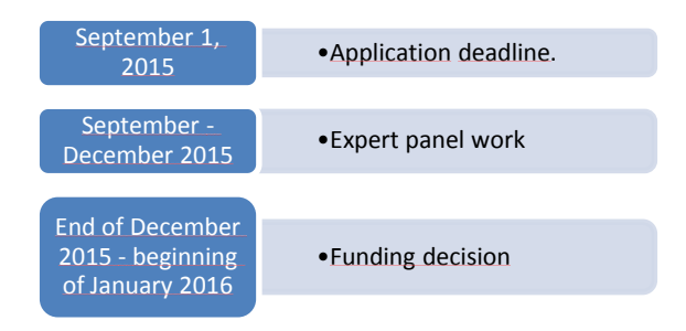
Figure 1. The time frame of the annual call.

The call for grant applications to the IRF is announced on the Rannís website 6 weeks before the deadline. The time frame of the call is described in Figure 1.