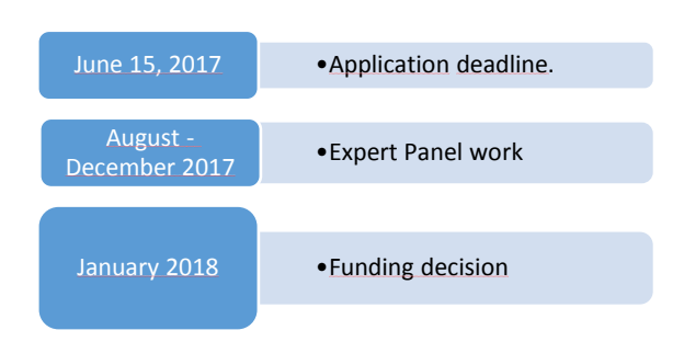
Figure 1. Estimated time frames for the grant year 2018.