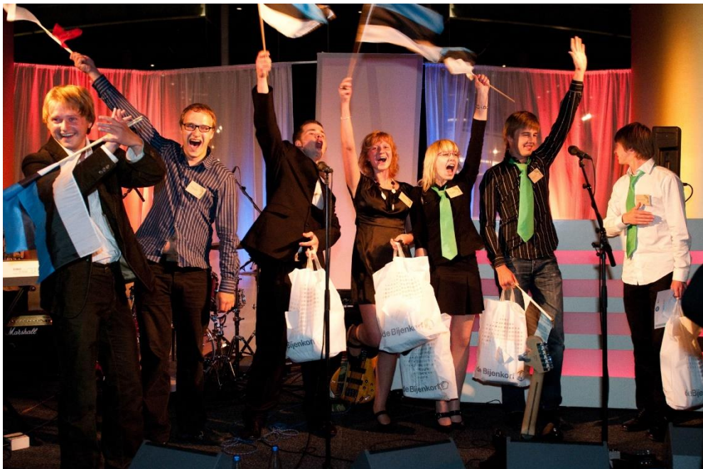
Touch of Green – Winner 2009