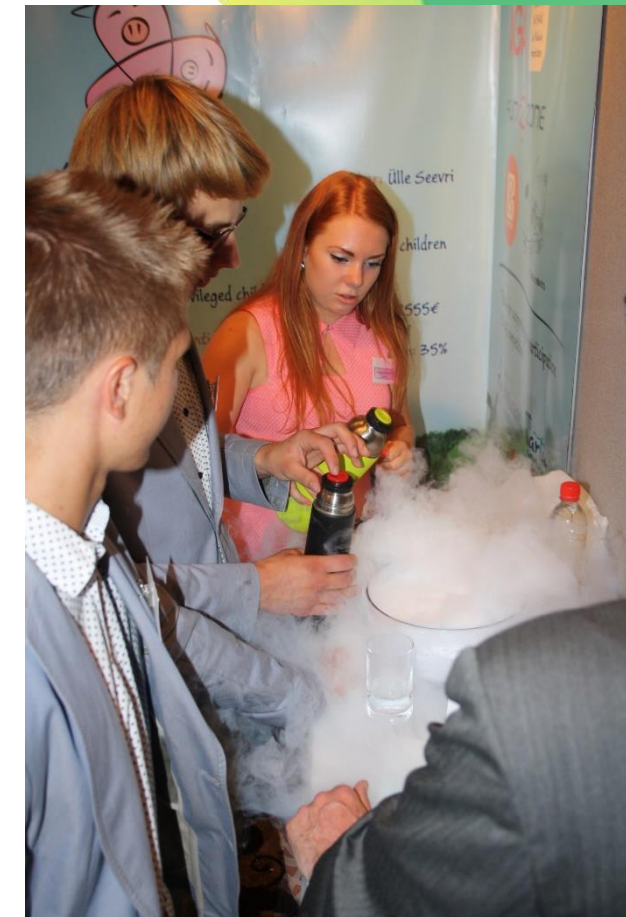
Three little pigs – Winner 2013