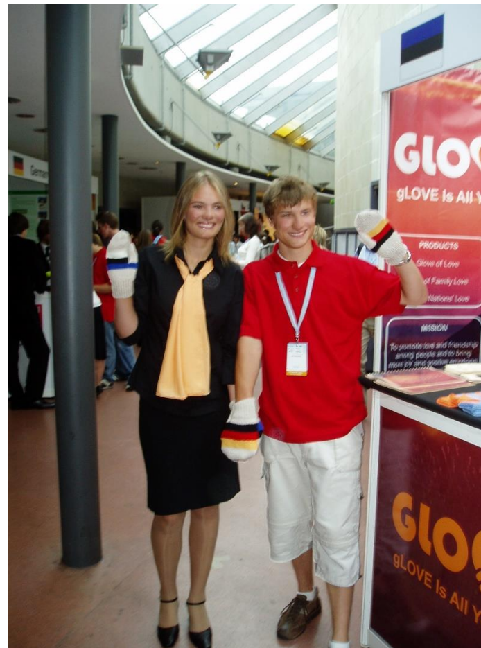
Glove of Love – First runner-up 2007